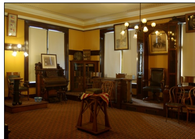
Capt. Thomas Espy Post No. 153 Grand Army of the Republic

In addition to housing a fine community library and acoustically superb music hall, the “Carnegie Carnegie” is home to a true national treasure — the Capt. Thomas Espy Post No. 153 of the Grand Army of the Republic. The Post has been documented as perhaps the most intact GAR Post in the country. At one time there were close to 7,000 posts from Portland, Maine to Portland, Oregon. The Espy Post was meticulously restored in 2010 to its turn of the last century condition.